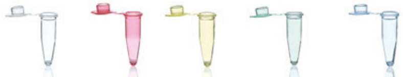
0.2 ml PCR tube with attached flat cap