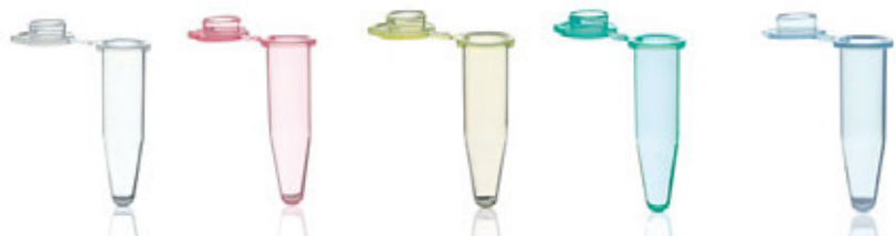
0.5 ml PCR tube with attached flat cap